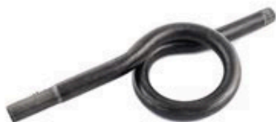
Mild steel BS EN10255 heavyweight