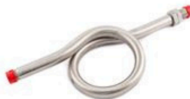
Stainless steel 316L