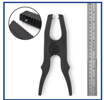
Spartan® Plier Clamp Long Jaw, with titanium tip