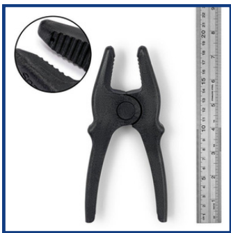
Spartan® Plier Clamp Heavy 40