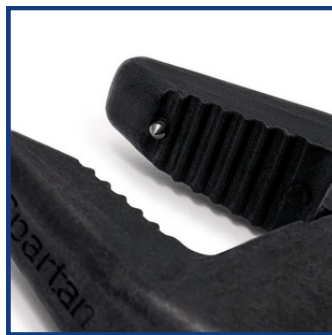
Spartan® Plier Clamp Heavy 55, with tip