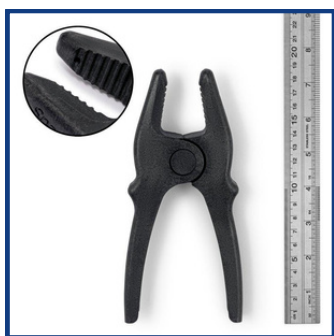
Spartan® Plier Clamp Heavy 40