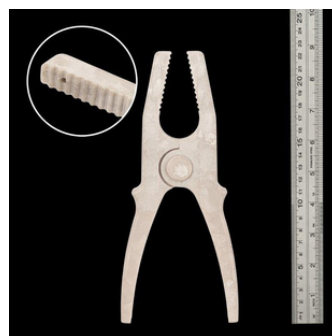
Spartan® Plier Clamp Narrow Jaw, in Radel