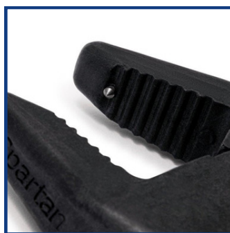
Spartan® Plier Clamp Heavy 55, with tip