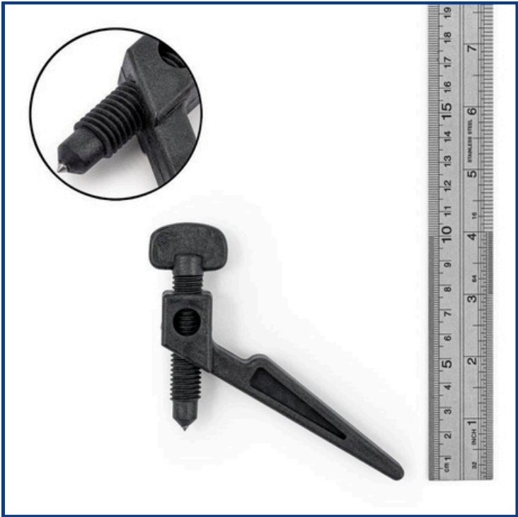
Spartan® Wedge Clamp with titanium tip