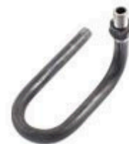
Right hand pattern