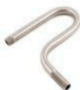
Stainless steel 316L