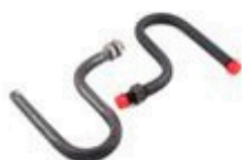
Mild steel BS EN10255 heavyweight